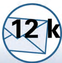
Kern 1600 flex

New functions, such as speed adjustment and preventive error handling are a great added value for our customers to increase production efficiency.