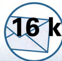
Kern 1600 fast